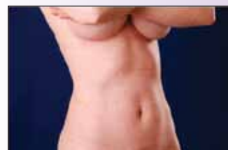
42 year old female four days after SmoothShapes Tx