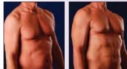
48 year old male after lipo sculpting of the back, flanks and abdomen