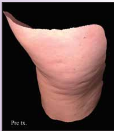
This is a close up of the right lateral thigh. The view is what a person with cellulite sees when they turn their head to the right and look down on their right thigh.

"In general, patients with more pronounced cellulite had greater visible and measurable benefit."