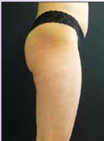
50 year old female six months after SmoothShapes Tx

would be for most non- or minimally invasive body contouring devices. “The most desirable patient for SmoothShapes treatment is healthy, active and physically fit, but has small areas of cellulite that have not improved despite healthy diet and exercise. In our experience, the most requested area for treatment is the bulging outer thigh, or saddle bags. Since SmoothShapes addresses localized areas of cellulite, these treatments are not as useful for the patient who has diffuse deformities or who is moderately or severely obese.”