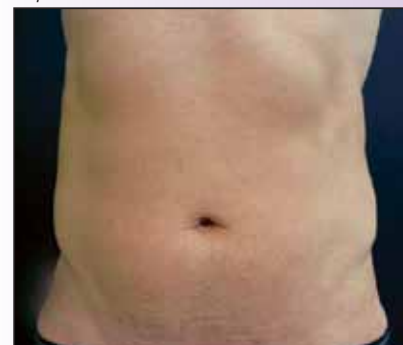
37 year old male six months after SmoothShapes Tx