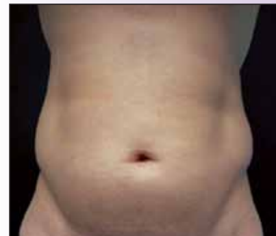
37 year old male before Tx