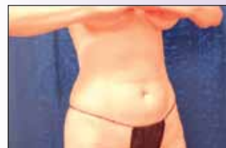
42 year old female after lipo sculpting of the flanks and abdomen

"SmoothShapes represents the first truly effective technology for moderate cellulite. We see improvement in dimpling and skin seems firmer, as well as smoother."