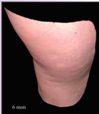
This six month after picture shows significant improvement in the surface contour.