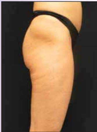
50 year old female before Tx

“The most desirable patient is healthy, active and physically fit, but has small areas of cellulite that have not improved despite healthy diet and exercise.”