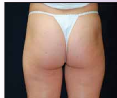
After SmoothShapes Tx